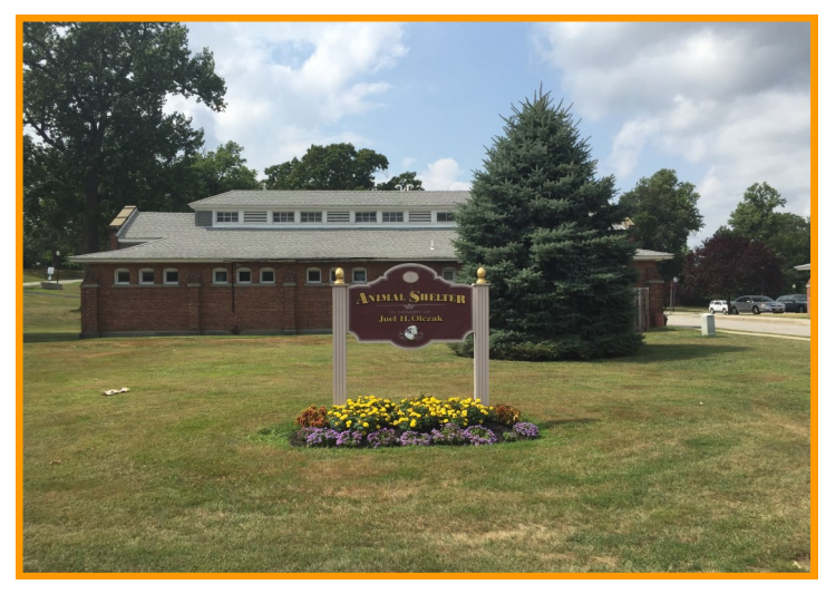
Clifton Animal Shelter

RABIES IMMUNIZATION CLINIC : Held in May & November of each year.